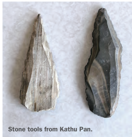
Stone tools from Kathu Pan.

Despite its wealth of extraordinarily ancient materials, time is running out for Kathu Pan 1. The region in which it is located is loaded with valuable minerals, and the